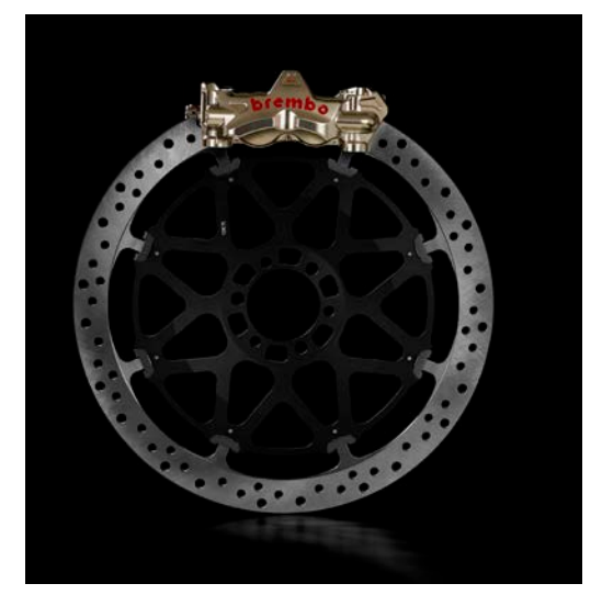
MotoGP brake system